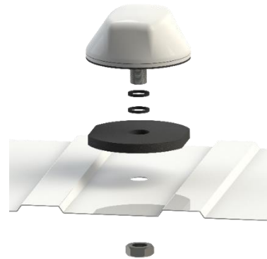
Exploded view of Mounting Kit