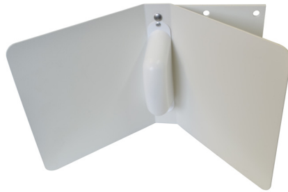
SCR12-2400 Large Corner Reflector