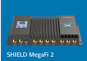
SHIELD MegaFi 2

This Guide shows Mobile Mark Antennas that are COMPATIBLE with your NEXTIVITY Routers. Smarter by Design