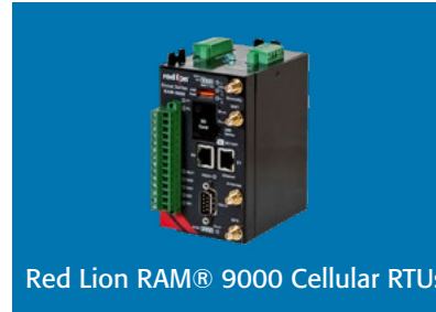
Red Lion RAM® 9000 Cellular RTUs