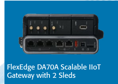
FlexEdge DA70A Scalable IIoT Gateway with 2 Sleds