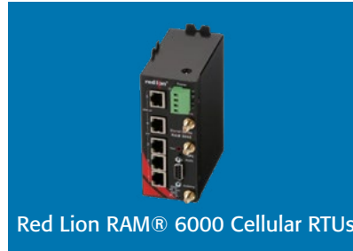
Red Lion RAM® 6000 Cellular RTUs