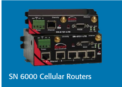
SN 6000 Cellular Routers