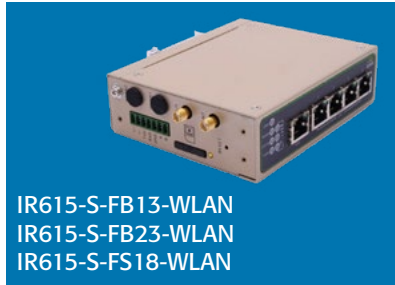
IR615-S-FB13-WLAN IR615-S-FB23-WLAN IR615-S-FS18-WLAN