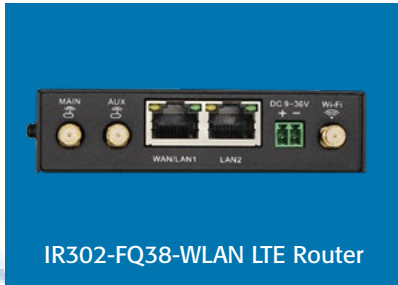
IR302-FQ38-WLAN LTE Router