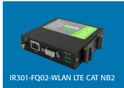
IR301-FQ02-WLAN LTE CAT NB2