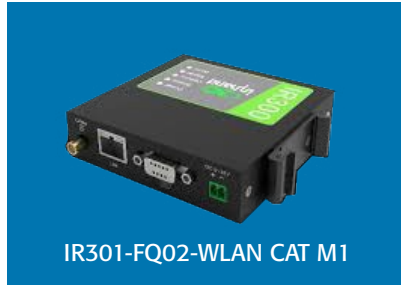
IR301-FQ02-WLAN CAT M1