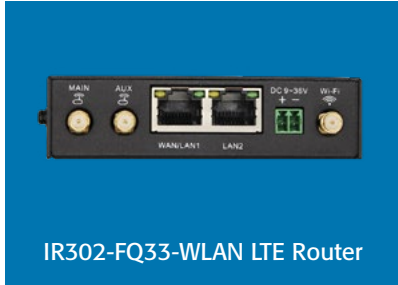
IR302-FQ33-WLAN LTE Router