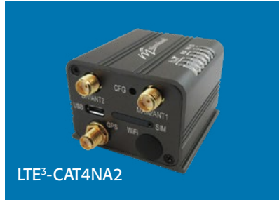
LTE 3 -CAT4NA2